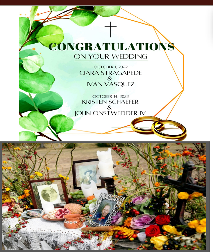
ALL SOUL'S DAY Art & Environment Ministry

In honor of All Soul's Day, the Art & Environment ministry will be creating a photo display of deceased loved ones during the month of November.