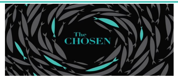
What Does It Mean To Be Chosen?

"But now thus says the Lord, he who created you, O Jacob, he who formed you, O Israel: "Fear not, for I have redeemed you; I have called you by name, you are mine." – Isaiah 43:1.